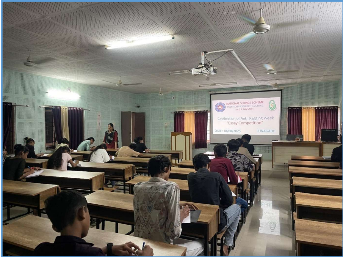
Photograph 4: Essay writing competition