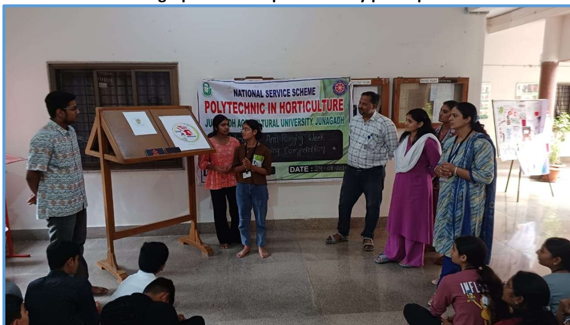
Photograph 3: Details of logo explained by participant to jury members.