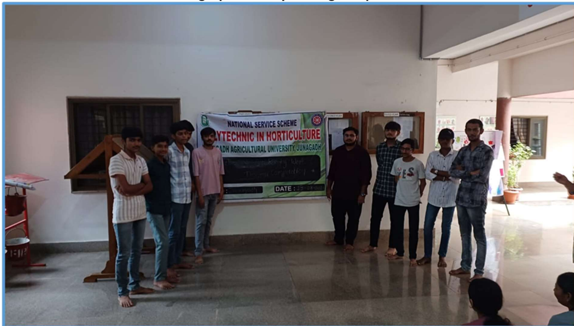
Photograph 5: Group photo of drama competition.