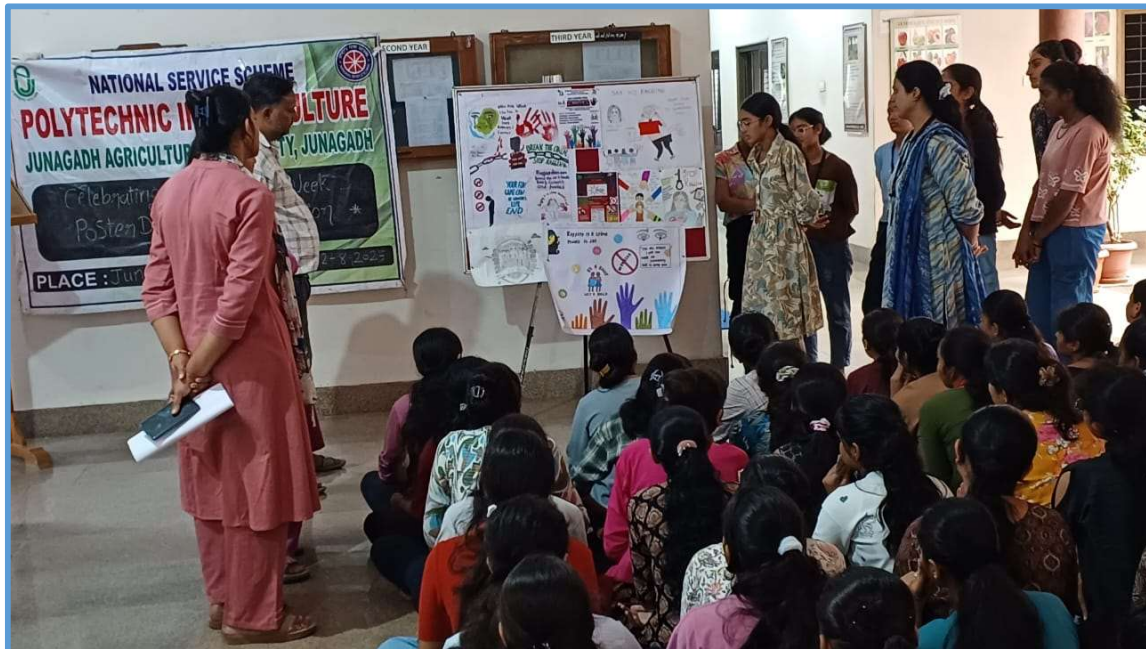
Photograph 2: Poster presented by participant.