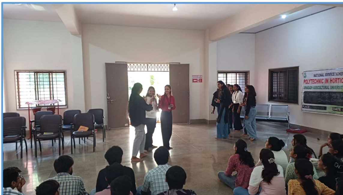
Photograph 6: Drama performed by students